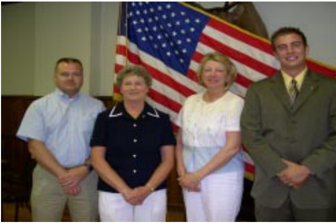
center with his grandson left and his son right.